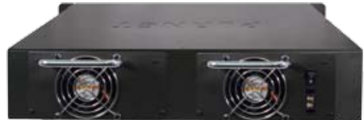
VDL-2420MR48 – One -48V DC