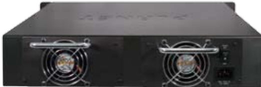
VDL-2420MR – One 100~240V AC

The VDL-2420MR series supports the optional hot-swappable Redundant Power System (RPS) to ensure continuous operation. The VDL-2420MR equips with one 100~240V AC power supply unit and the VDL-2420MR48 equips with one DC -48V power supply unit on their standard package. To enhance the reliability, both the VDL-2420MR and VDL-2420MR48 provide one spare power supply unit slot for optional 100~240V AC or DC -48V redundant power supply installation. The continuous power systems are specifically designed to handle high tech facilities requiring the highest power integrity available. Also, the -48V DC power supply implemented makes the VDL-2420MR series VDSL2 DSLAM as a telecom level device that can be located at the electronic room.